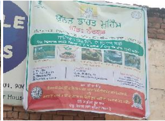
Glimpses of the survey about village level and household level conducted in five adopted villages