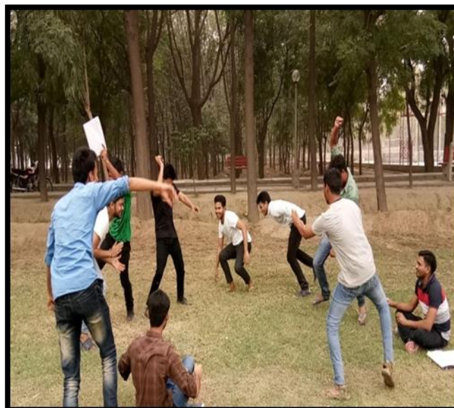
Students Performing Nukad Natak

Seed Rakhi To celebrate raksha bandhan seed rakhis were distributed among masses in villages. The seed rakhi apart from carrying the traditional idea of love of brother and sister also signifies the contribution of person towards environment. The volunteers of NSS distributed more than 500 rakhis on 5 th August 2019 encapsulating the seeds of different plants with a message “Do not throw me in the dustbin rather plant me I will be a tree one day”.