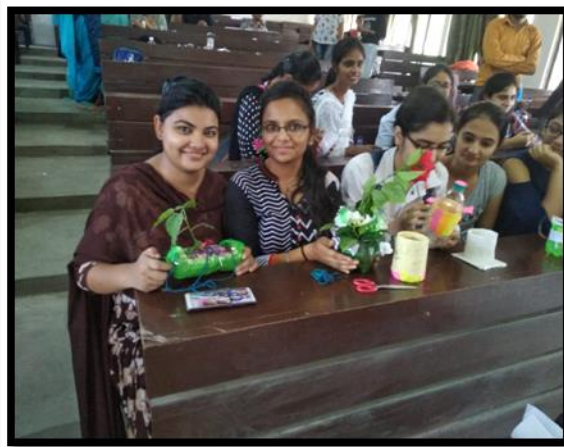
Display of various articles made by students from reuse of plastic bottles