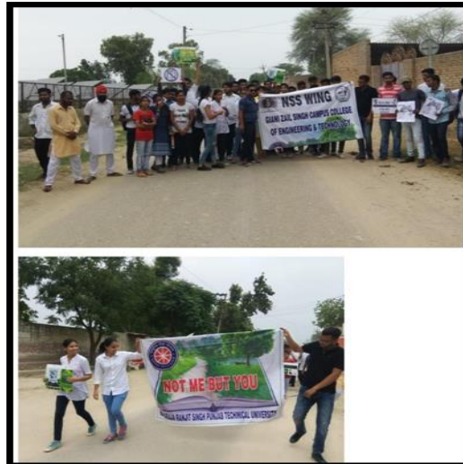
Volunteers during awareness program in adopted village

District Youth Parliament: The Minister of State (I/C) for Youth Affairs and Sports launched the National Youth Parliament Festival 2019 as part of National youth day celebrations. The first step towards national youth parliament was district youth parliament which was conducted in Maharaja Ranjit Singh University Bathinda on 24 th January 2019. The district youth parliament festival for three districts Bathinda, Mansa and Sri Muktsar Sahib was conducted at MRSPTU Bathinda. The youth in the age bracket of 18-25 who are allowed to vote, but not allowed to contest in elections participated in this festival. Three days special screening camp from 17 th – 19 th January 2019 was organised for the selection of participants. Nine institutes including Central University of Punjab, Guru Kashi University, MRSPTU, GZSCCET, SSD College, PIT Nandgarh, participated in screening.