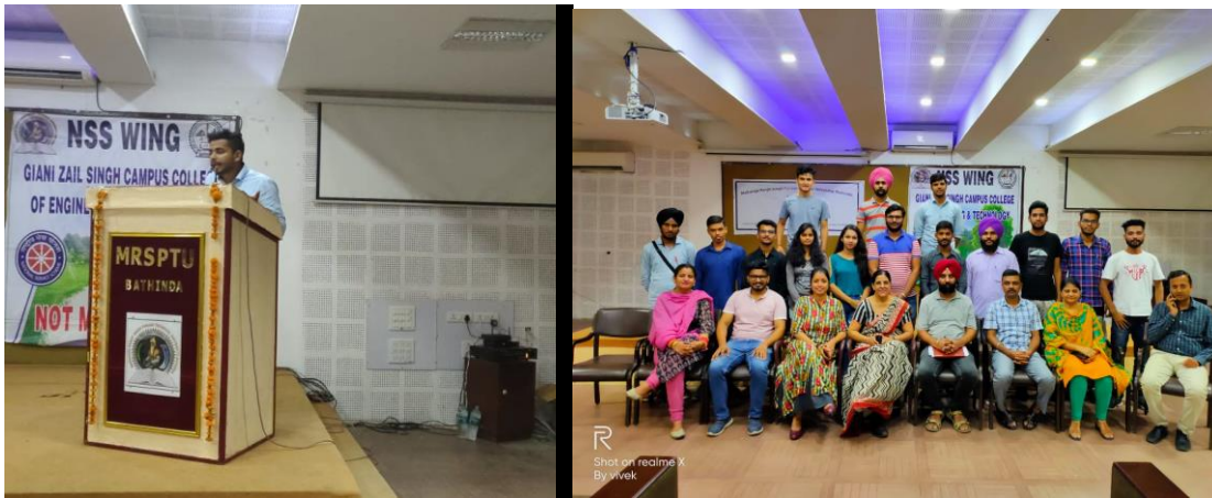
Students participating in model making competition, group discussion and debate on reuse of waste plastic during NSS day celebration

Surgical Strike Day: the unit celebrate surgical strike day to commemorate the sacrifices laid by the Indian army