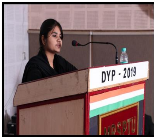
Glimpses of Celebration of District Youth Parliament -19

International Yoga Day Celebration: International yoga day is celebrated on 21 June every year. The volunteers from NSS actively participate in yoga day celebrations. An expert yoga guru trained the participants for yoga.