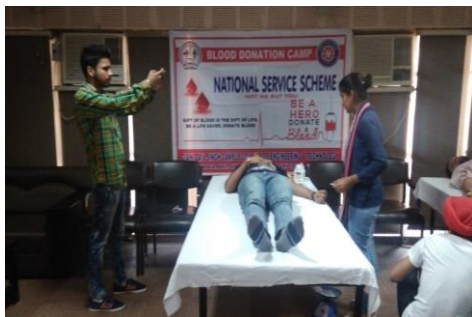
Blood donation camp at MRSPTU

Blood Donation camp and first aid training camps are organized as an annual feature to train NSS volunteers for societal uplifting.