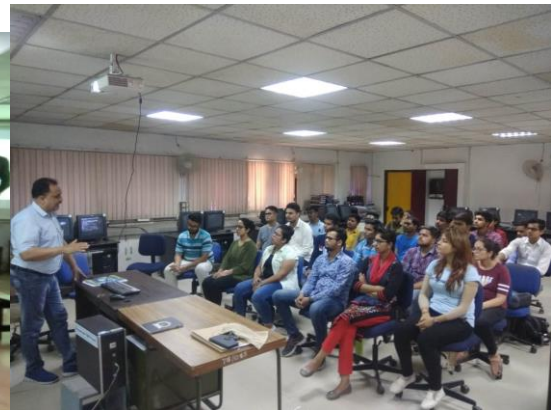
Drug de addiction drive at MRSPTU, Bathinda

Blood Donation camp and first aid training camps are organized as an annual feature to train NSS volunteers for societal uplifting.