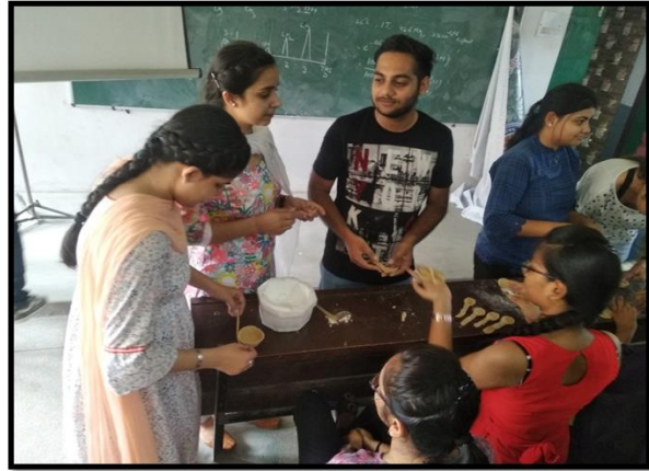
Students preparing edible crockery from household grocery

Poster making competition: poster making competitions are organized on environmental awareness.