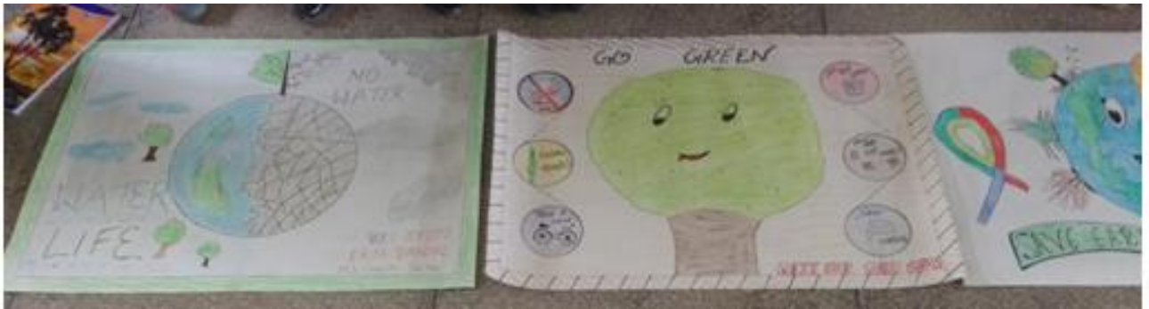
Awareness about environment through posters

Poster making competition: poster making competitions are organized on environmental awareness.