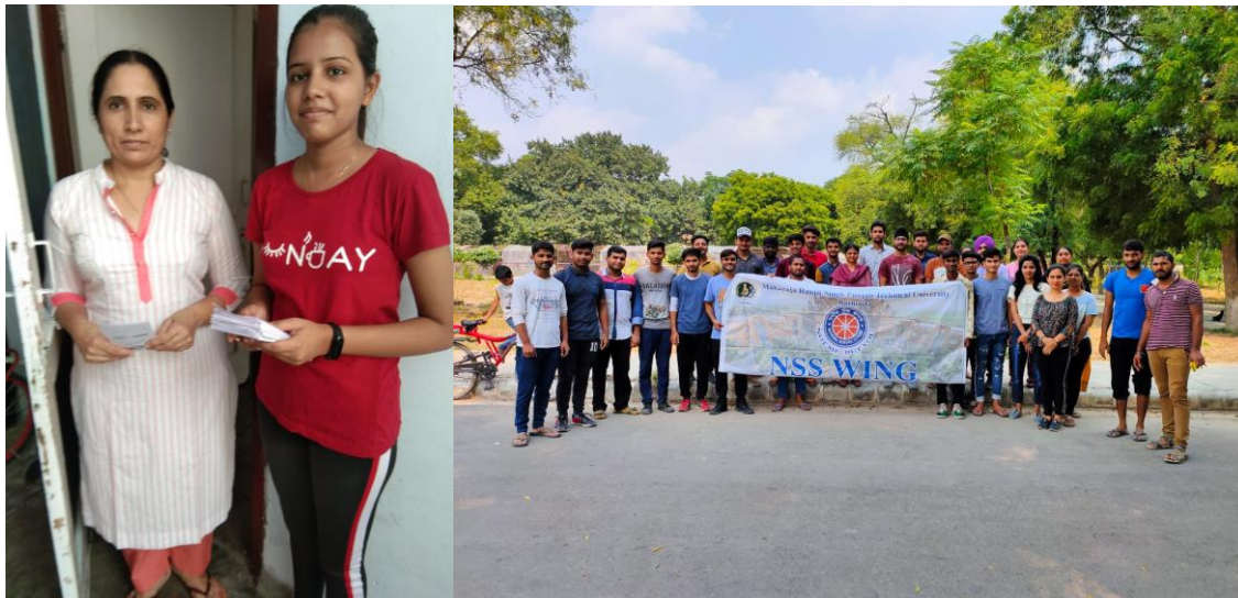
Awareness Drive for Plastic Hazards