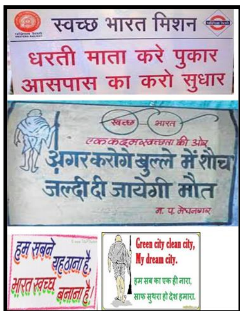
Poster Making Competition