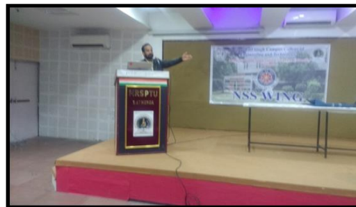
Demonstration on First aid training