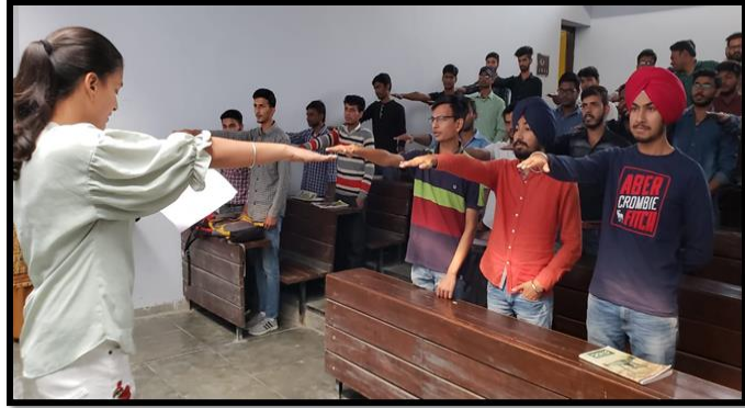
Poster display and pledge ceremony on voters day

Drug de addiction Awareness programs To spread message of bad effect of drugs the drug de addiction programs was organised on 26 February 2019 and 26 June 2019. A team of doctors from IVY hospital and health centre MRSPTU discussed various drugs and their bad effects on health.