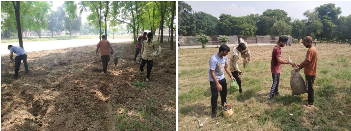
Plastic collection from campus during swachhta drive