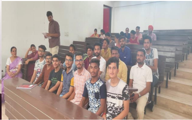
Debate to discuss causes and consequences on anaemia and malnutrition

ASER Camp: ASER camp is second largest survey conducted in India. Our volunteers carried out ASER camp in 60 villages in 2 districts Bathinda and Mansa. The five day camp included three day training and two day field work. The survey was conducted at three different levels for a) the knowledge of children in the age group 4-16 was recorded, b) the economic survey of families including their family income, gadget they had etc were conducted, c) the survey of villages for their basic facilities was conducted.