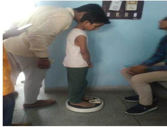
Volunteers during BMI camp to access nutrition status among kids