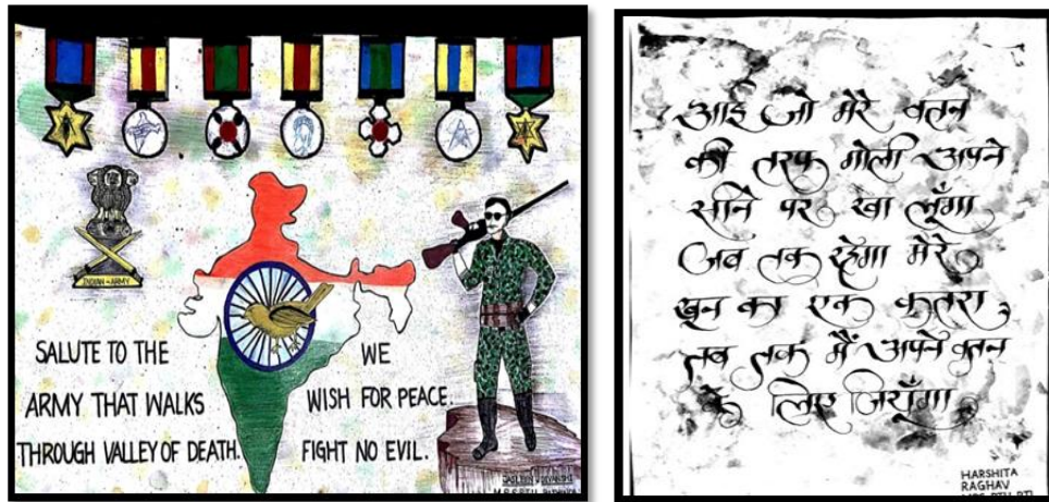
Prize winning poster and slogan on surgical strike day

Community Service: Apart from other activities our volunteers perform community service. Students from various NSS Units performed community service at Gurudwara in the locality encouraging everyone on the way to keep their surroundings spick and span and clean. The students took the charge of cleanliness of the Gurudwara and its surrounding area.