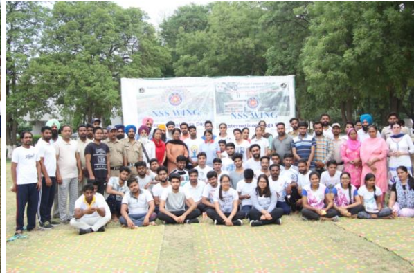
Yoga day celebration on 21 st June 2019

Fit India Movement: A pledge was taken by all the NSS units of MRSPTU and a rally was organized in collaboration with sports department of the university.