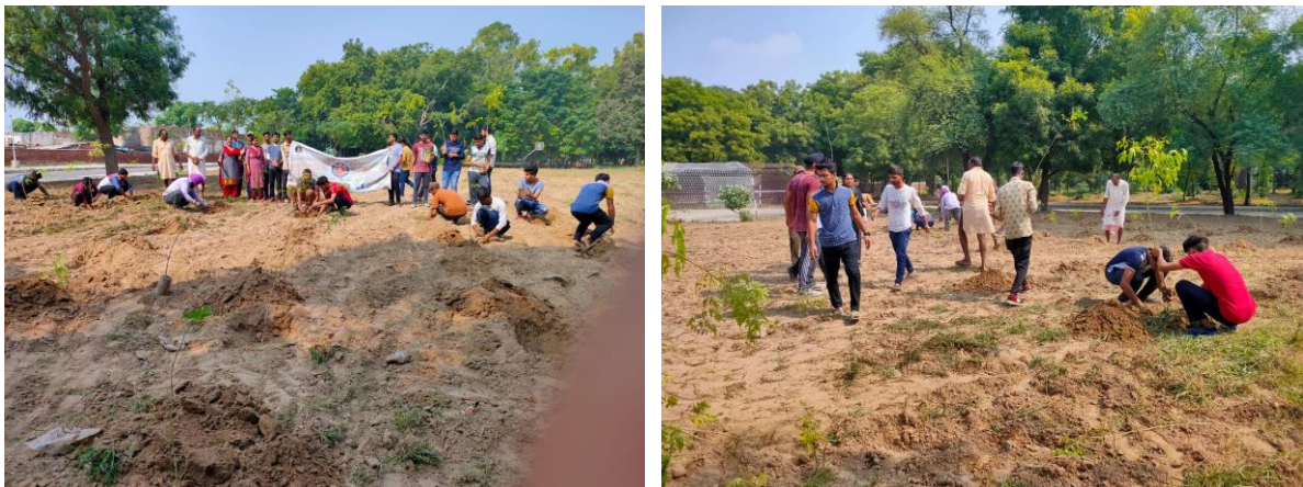
Tree plantation drive by NSS volunteers

Swachhata Abhiyaan: To inculcate the values among students various programs including nukad natak and mime, group discussion and model making competition to make campus and city free from plastic and pollution are undertaken regularly. To commemorate Gandhi Jayanti different activities including tree plantation, plastic collection from campus, awareness program for masses and poster making competition , were undertaken.