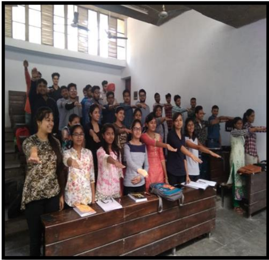
Pledge to be fit and keep india fit

Fit India Movement: A pledge was taken by all the NSS units of MRSPTU and a rally was organized in collaboration with sports department of the university.