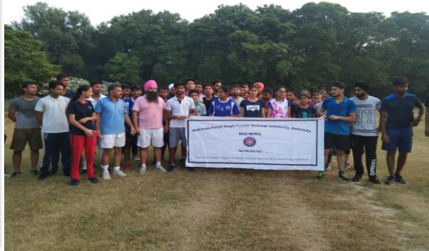
Rally on fit India hit India

NSS day was celebrated in university around 200 volunteers from GZSCCET and MRSPTU participated. Main events during the celebrations were a) model making competition (best out of waste from plastic) b) debate and declamation on plastic waste, c) group discussion on swachhta hi sewa d) a dietician from Max hospital to discuss different life style problems.