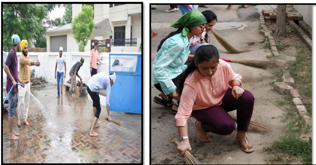
Students performing community service at Gurudwara

Community Service: Apart from other activities our volunteers perform community service. Students from various NSS Units performed community service at Gurudwara in the locality encouraging everyone on the way to keep their surroundings spick and span and clean. The students took the charge of cleanliness of the Gurudwara and its surrounding area.